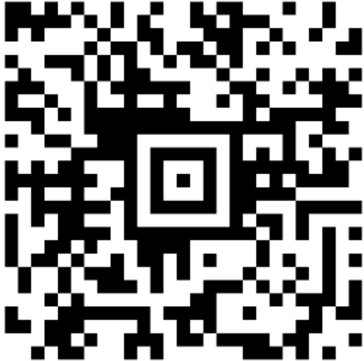
Event Pass Check-in at supporting events

Start by signing into Coyote Connection. Next, click on your profile picture in the top right of the screen (it may display your first initial if you do not have a profile picture). Click this and it will display your unique code.